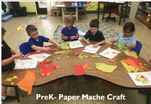
PreK- Paper Mache Craft