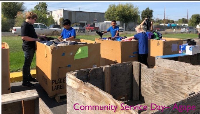
Community Service Day- Agape